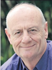
Tim Costello World Vision chief and Christian activist